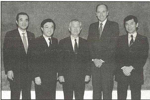
New COE/GC Board of Directors